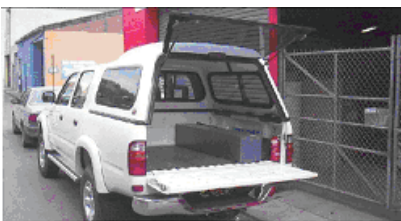
Doors must be locked while vehicle is unattended and keys not left in vehicle