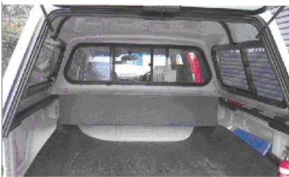
Safe bolted to structural parts of vehicle

NOTE: At no time should a firearm be left stored unattended in a motor vehicle unless the firearms are stored in accordance with the requirements of Category C, D and H firearms and no alternative safe storage is available.